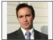
Joe Kennedy, Candidate for U.S. Senate